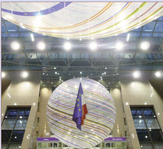
Figure 2. Reflection of the globe in lightweight mirror