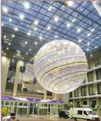
Figure 1. Inflatable globe